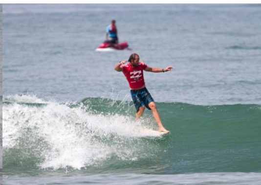
Taylor Jensen (USA) 2013 ASP World Longboard Tour Champion