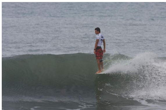
Antoine Delpero (FRA) 2009 ISA Longboard World Champion